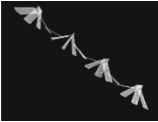
FIG. 1. Consecutive images from a video of a thin card tumbling counter-clockwise through air. The card dimensions are approximately 75 \text{ mm} \times 15 \text{ mm} \times 0.1 \text{ mm} , the density of the card material is 1.34 \text{ g/cm}^3 , the tumbling frequency is approximately 15 \text{ Hz} , and the individual images are 1/60 \text{ s} apart. The apparent changes in the dimensions of the card are illustrations of perspective.

of behavior: (a) two equilibria corresponding to the card falling in its (stable) broadside-on and (unstable) end-on configurations, (b) a solution that connects these equilibria guaranteed by the periodicity of the angle characterizing the orientation of the card, and (c) a means of bringing the two equilibria together as some parameter such as w/d or the drag coefficient is changed. This last ingredient is where the individual models differ; however they all lead to a saddle-node bifurcation 16 beyond which only the tumbling mode is stable. 17 Since studies focusing on the flutter-tumble transition alone do not characterize the physics completely, we have experimentally probed the tumbling of strips far from this transition.